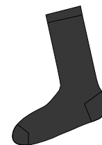
Sock - Winter