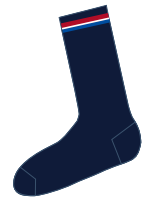
Sock - Summer