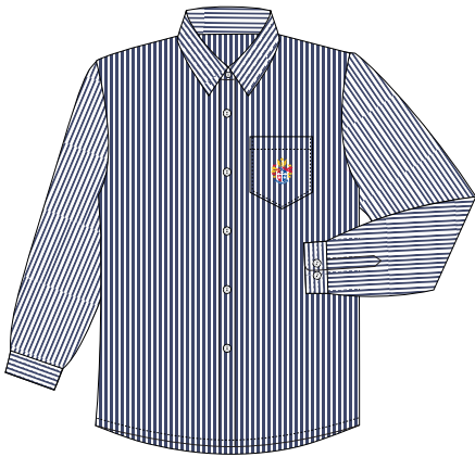
Long Sleeve Shirt