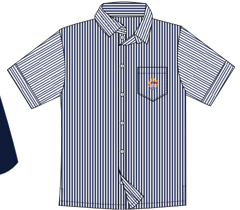
Short Sleeve Shirt