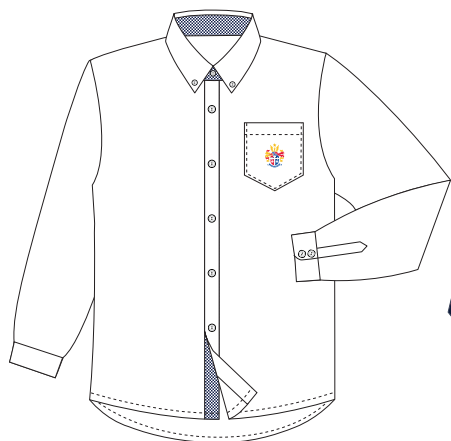
Long Sleeve Shirt