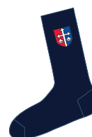
Sock - Summer