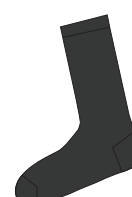
Sock - Winter