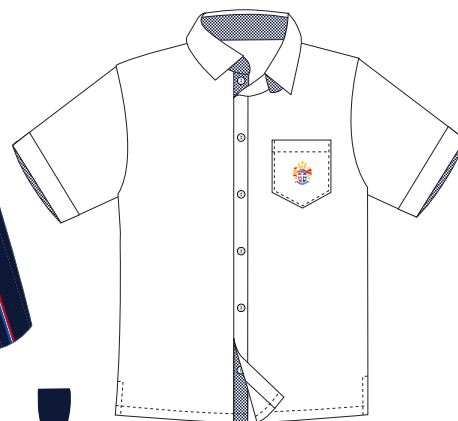
Short Sleeve Shirt